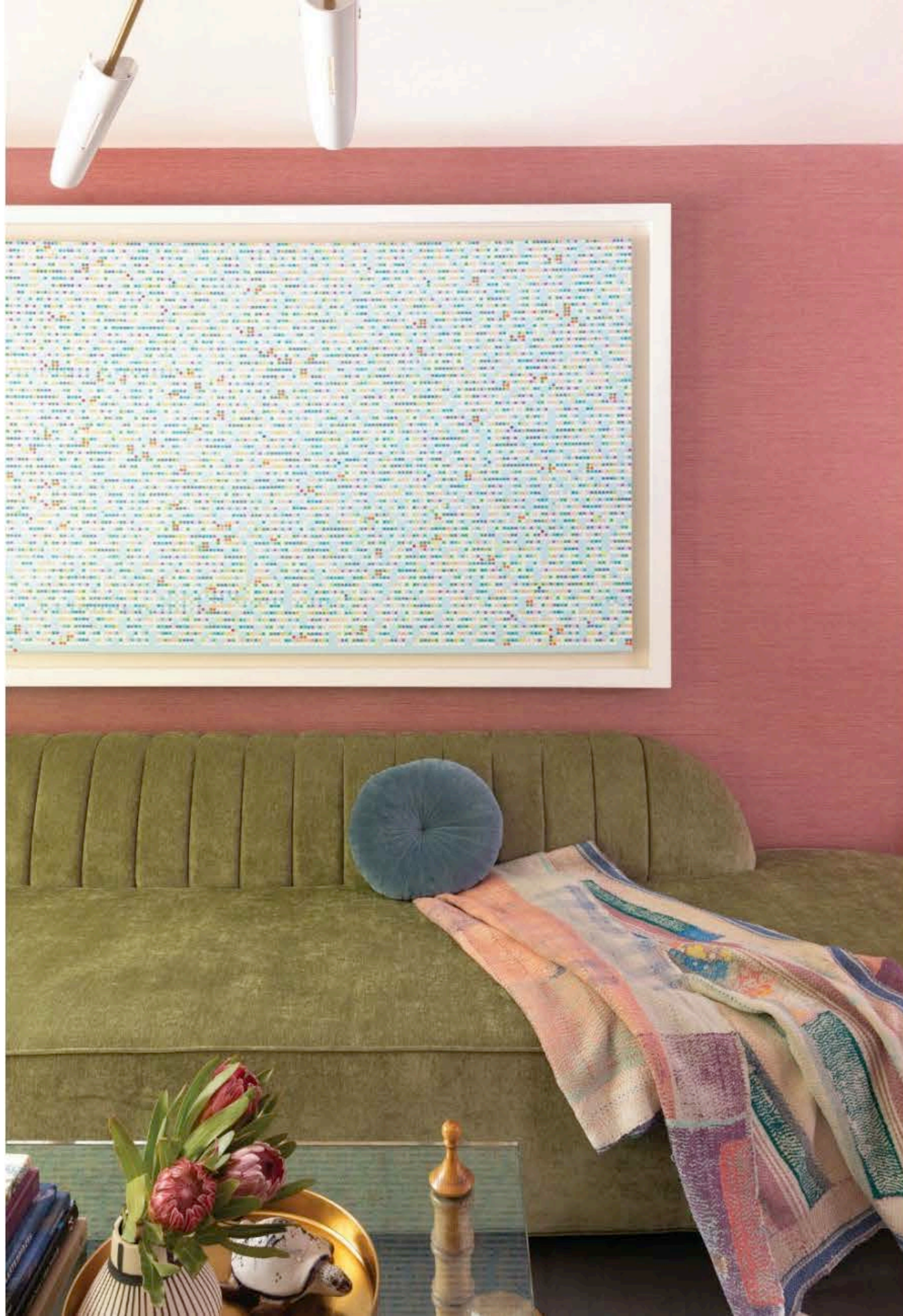
Textiles from Atlanta-based Aloka Home help soften the lounge space.